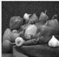
g) Average filtering