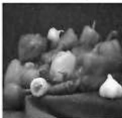
e) TV denoising