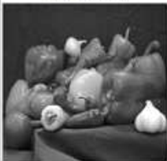
a) Original image