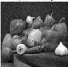
h) Median filtering