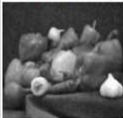
d) Perona-Malik denoising