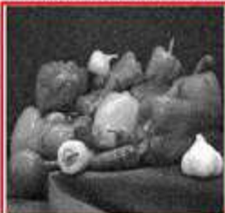
c) Image restored by our AD model