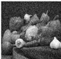
b) Degraded (noisy) image